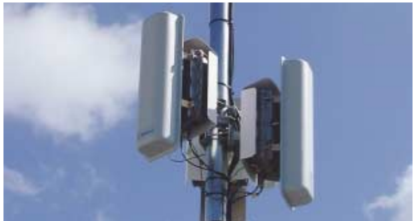
HiperMAX mast head units deployed in Vodafone Malta

HiperMAX base stations cooperate with the IMS which is part of the Connectivity Service network (CSN) to deliver voice and other multimedia services and can also be configured to support VoIP applications, using a standard media gateway to the PSTN.